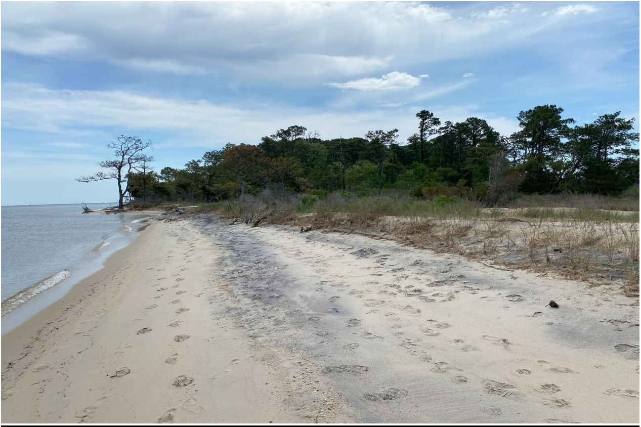
Kohls Island beach where the Potomac River meets the Chesapeake Bay