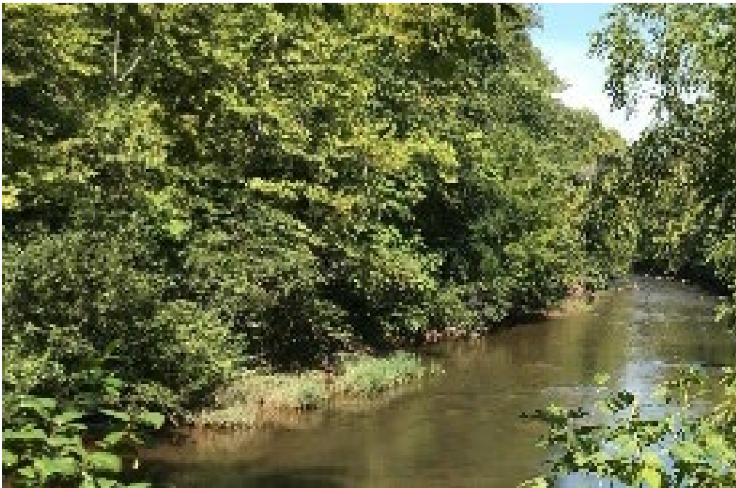
The Rockfish River frontage along the VOF property