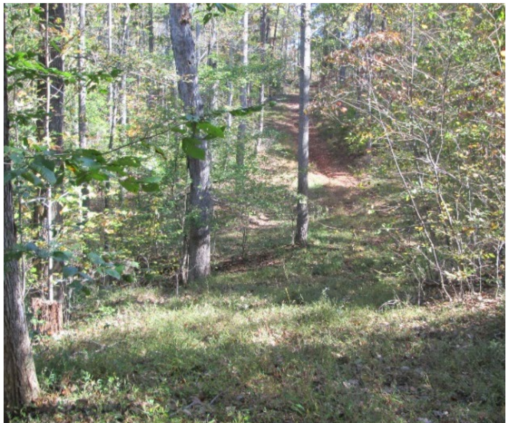
Interior view of the Rockfish parcel