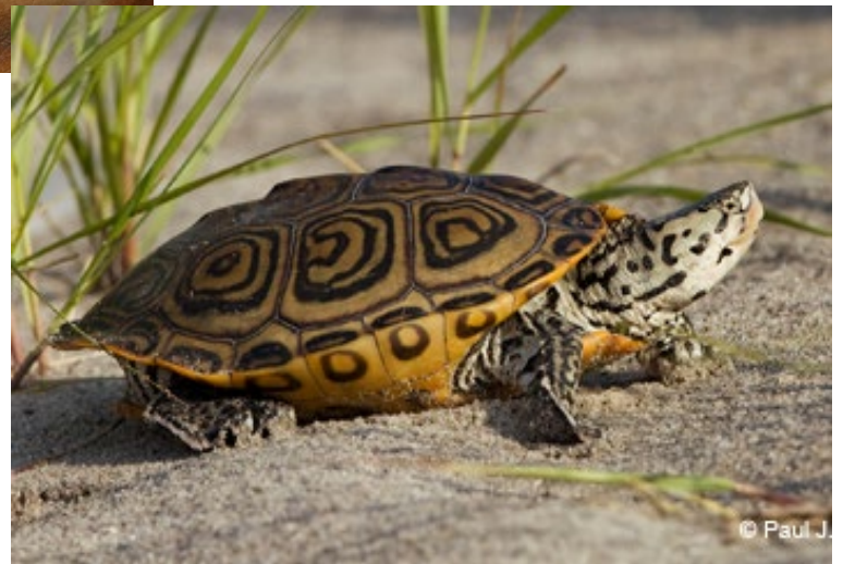
Northern Diamondback Terrapin