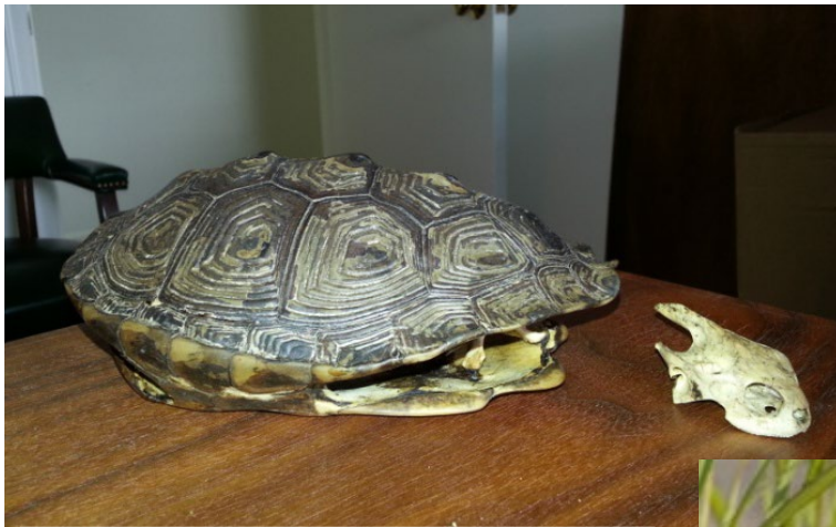
Northern Diamondback Terrapin shell and skull from Kohls Island

Kohls Island is one of few remaining intact beach and coastal dune systems on the northern neck. It has been known for years that Kohls Island is home to the threatened tiger beetle and the vulnerable seabeach knotweed. The island is also home to another endangered species, the Northern Diamondback Terrapin. This terrapin is the only turtle in the U.S. that lives exclusively in brackish saltwater marshes, coastal bays and lagoons. During the summer the females look for sandy beach areas or coastal dunes to lay their eggs. The Northern Diamondback Terrapin is listed as a species of concern in Virginia due to loss of appropriate habitat and the Virginia Department of Wildlife Resources considers the Commonwealth's diamondback terrapin population as "Near Threatened."