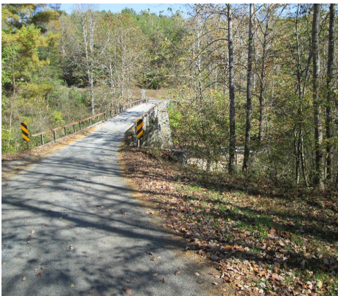
Farrar Bridge over Rockfish River

The property was acquired as substitute land resulting from a 2017 agreement with the Atlantic Coast Pipeline, LLC to satisfy statutory requirements associated with the proposed development of the Atlantic Coast Pipeline going through nine open space easements held by VOF in the western part of the state. The deed of conveyance to VOF specifies that the property must be permanently protected under the Open Space Land Act. An adjacent parcel to the east, also fronting Rockfish River, was acquired by The Conservation Fund as mitigation and is subject to a VOF open space easement. Discussions with Nelson County and offer to transfer the property so it could become a public park did not advance. The proposed terms for the open space easement were approved at the March 27, 2024 board meeting.