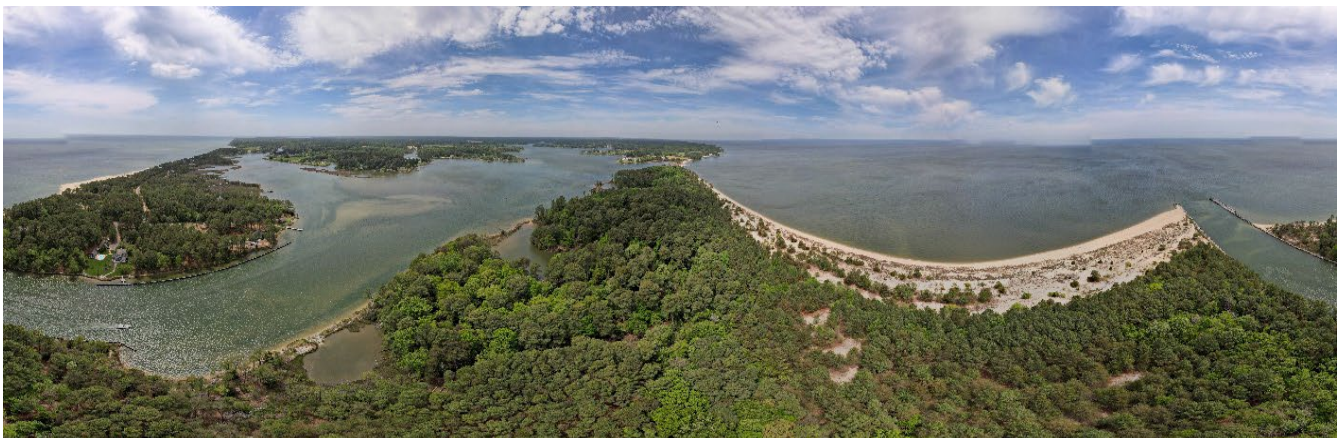
Drone view of Kohls Island with the Little Wicomico River channel on the right of screen